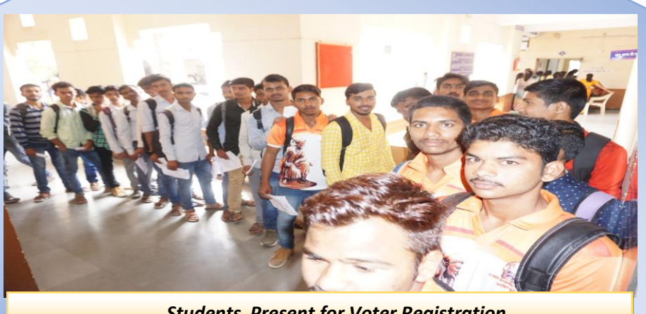
Students Present for Voter Registration