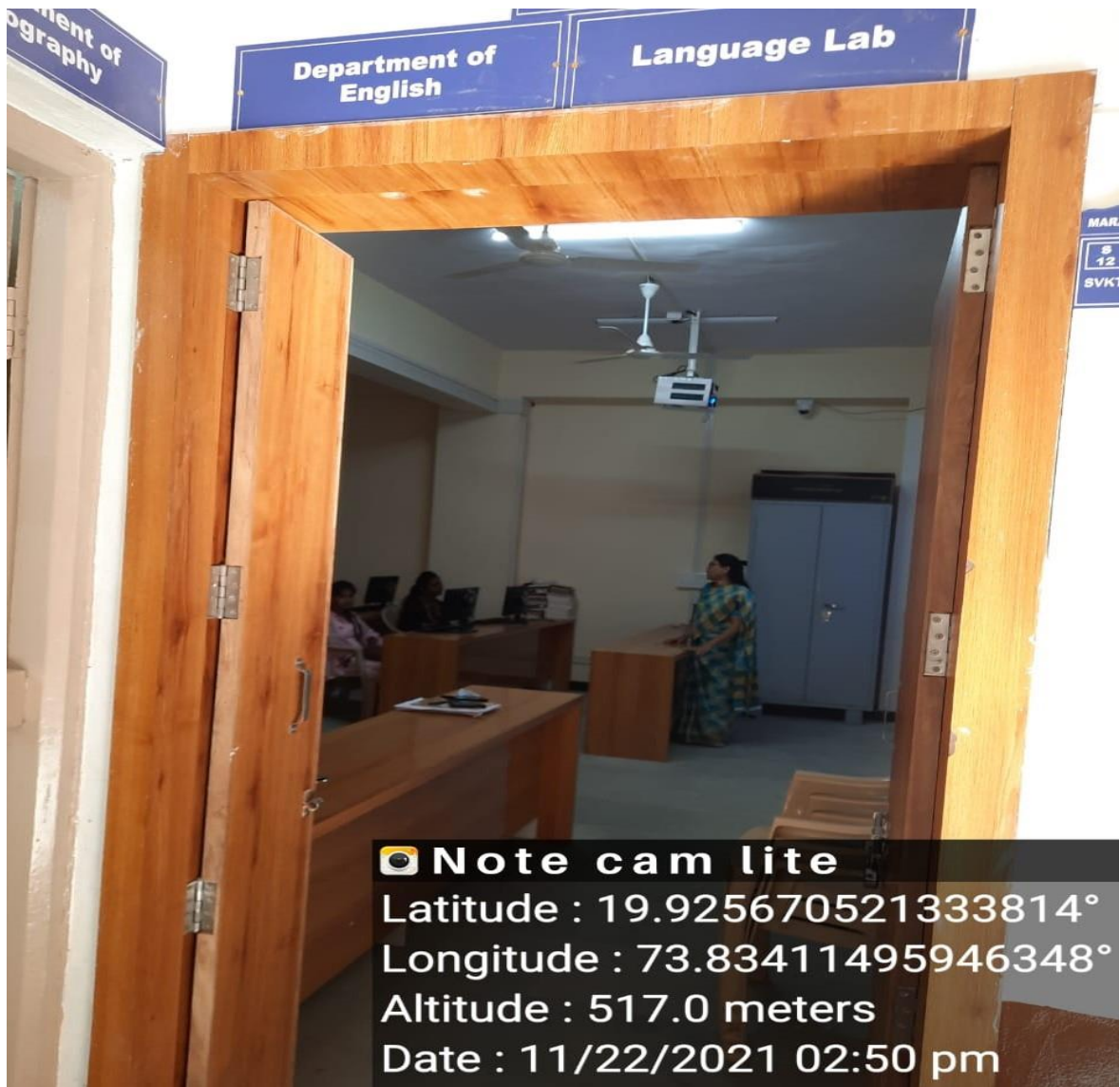
English Language Lab