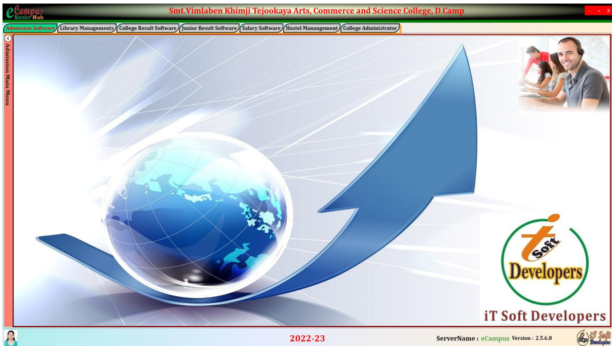
Home page of Software