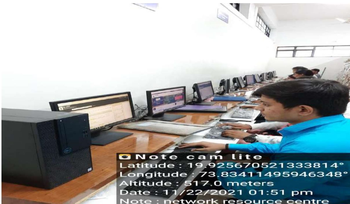
Network Resource Centre