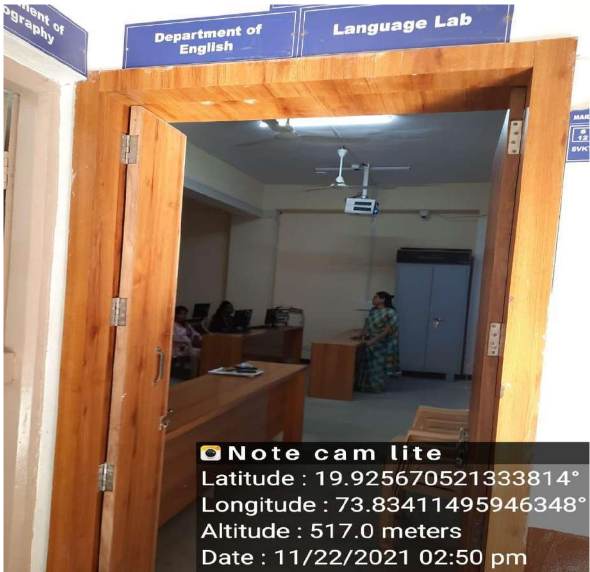
English Language Lab