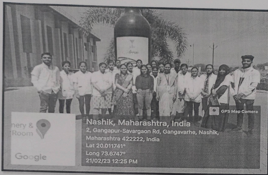
Visit to York Winery, Nashik