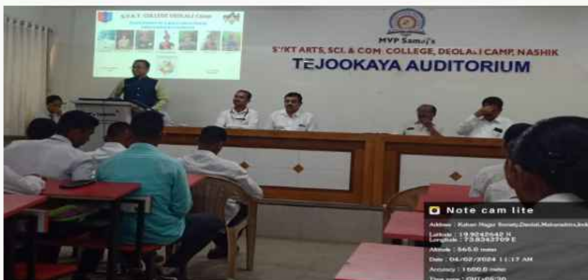
Photo plate:- Our 11 students selected as Aagniveer in Indian Army. Felicitation of selected students on 4/02/2024 and they share their experience with students.